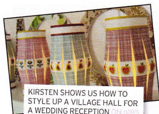
KIRSTEN SHOWS US HOW TO STYLE UP A VILLAGE HALL FOR A WEDDING RECEPTION ON PG5 - WE LOVE THESE LANTERNS!